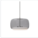
PD70615-SM/BN Smoked/Brushed Nickel