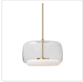
PD70615-CL/BG Clear/Brushed Gold

Complementary intersecting glass shapes and contrasting finishes define this elegant fixture. The LED light is centered within a soft opal diffuser that is enveloped by a larger transparent glass shade. The outer glass shade is available in Smoked or Clear and may be combined with either Brushed Nickel or Brushed Gold metal finishes.