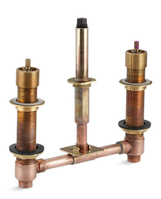
Codes/Standards ASME A112.18.1/CSA B125.1