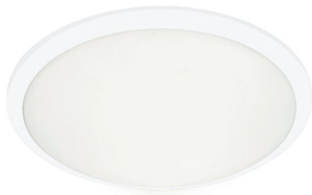
WH - White