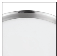
BN - Brushed Nickel