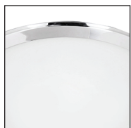
CH - Chrome