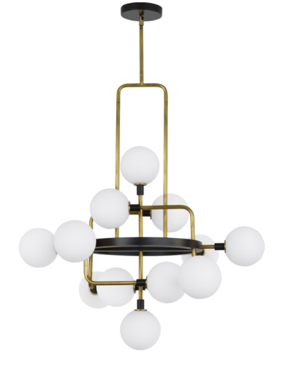
Opal / Brass