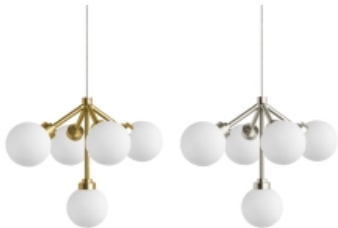
White/Aged Brass White/Satin Nickel