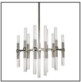
PN - Polished Nickel