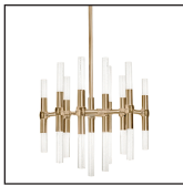
VB - Vintage Brass