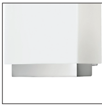
CH - Chrome