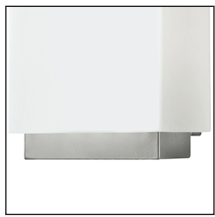
BN - Brushed Nickel