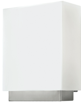
BN - Brushed Nickel