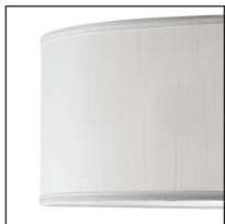
WH - White