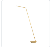
FL25558-BG Brushed Gold