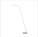
FL25558-BN Brushed Nickel