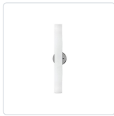
WS8324-BN Brushed Nickel